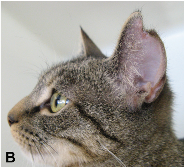
Figure 2 —Photographs illustrating unilateral ear tipping to indicate that a community cat has been neutered (A) and showing a community cat with an injured ear flap (B). Ear tipping, rather than notching, is recommended to identify neutered community cats, because ear tipping results in a distinctive straight edge whereas ear flap injuries may easily be mistaken for surgical ear notching.

be returned to their traps or transport carriers while unconscious for recovery monitoring. In this case, cats should be carefully monitored to ensure that movement or turning in the confined space during recovery does not compromise airway patency; gentle rocking or tilting of the trap or carrier may be necessary to safely reposition the cat's head and neck.